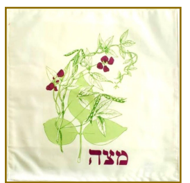
BARBARA SHAW - $54.00 On The Vine Matzah Cover 14"x14"