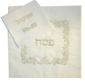
TAMAR - $36.00 MATZAH COVER 17"X17"