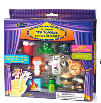
10 PLAGUES FINGER PUPPET/HARD - $14.00

10 PLAGUES DART GAME - $12.00 Velcro Darts