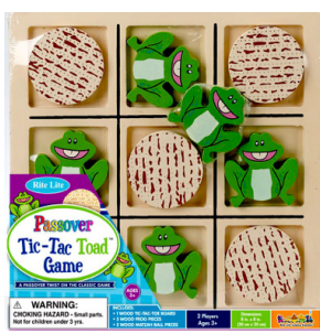
GAME OF FOUR $8.00