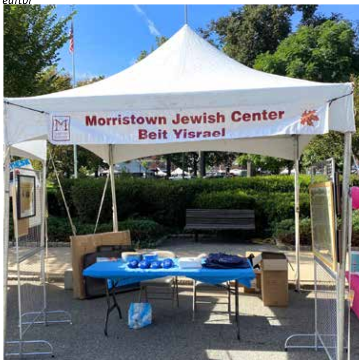
FESTIVAL ON THE GREEN