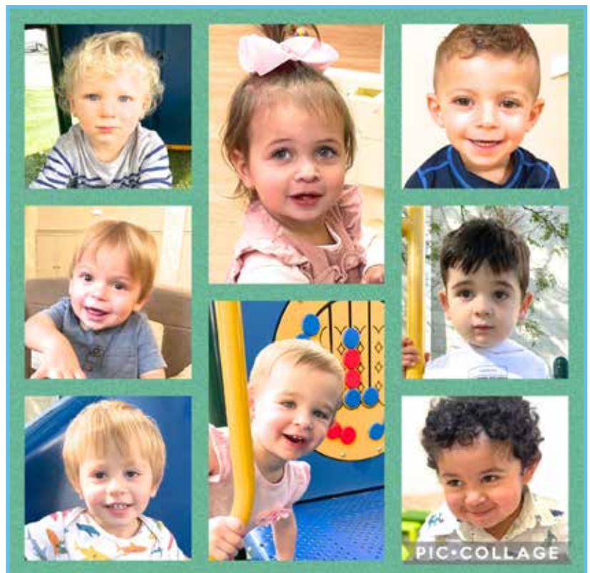
MEET OUR LITTLE ONES!