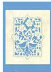
1. All Purpose

Send special greetings to your family and friends...and have Torah Fund be an additional beneficiary of your kindness and thoughtfulness.