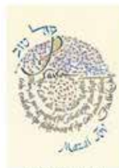
5. Condolence Psalm 23