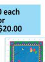
8. Get Well