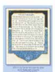
6. Condolence Psalm 42