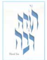
4. Thank You