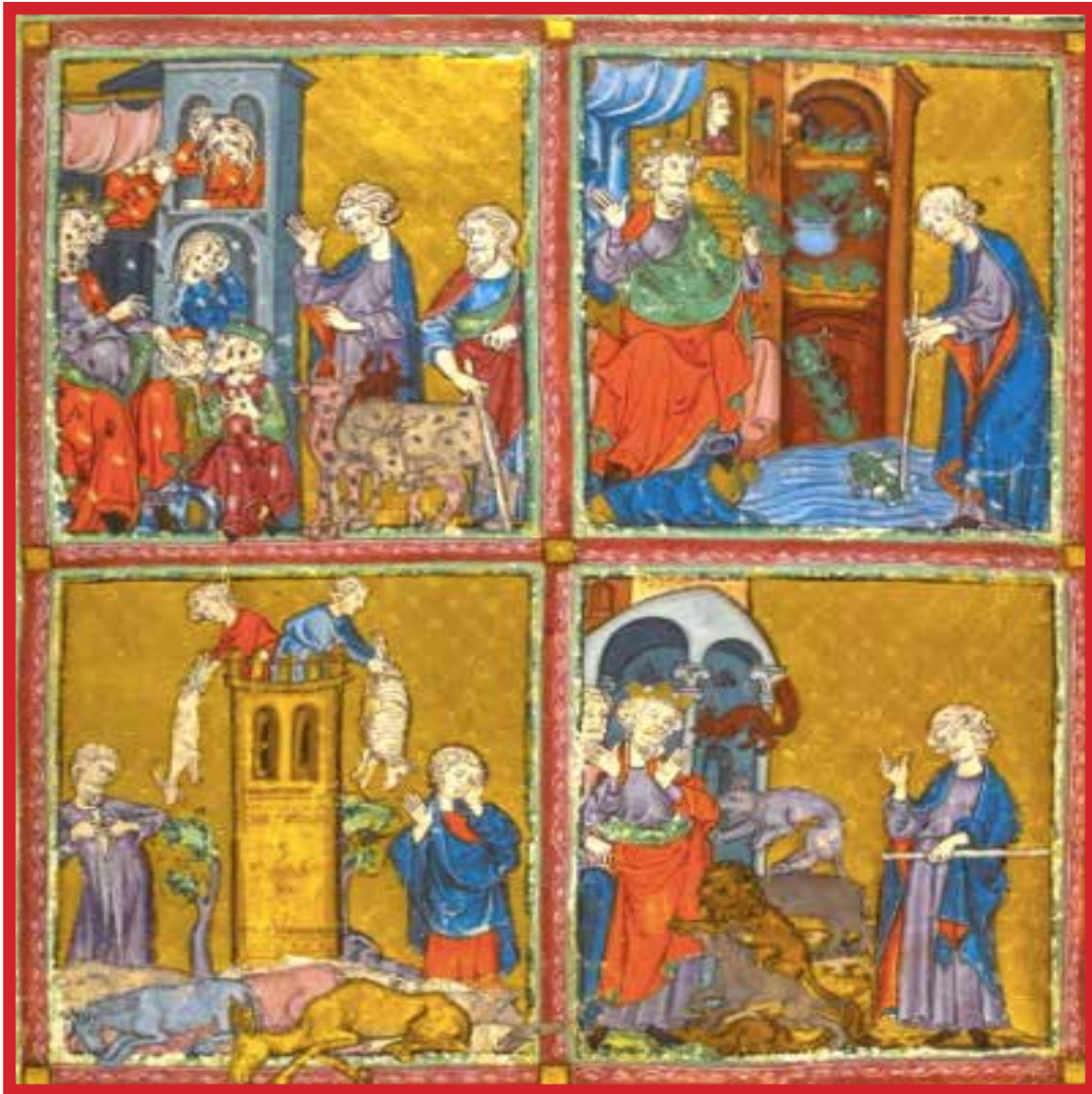
From the Golden Haggadah, c. 1320