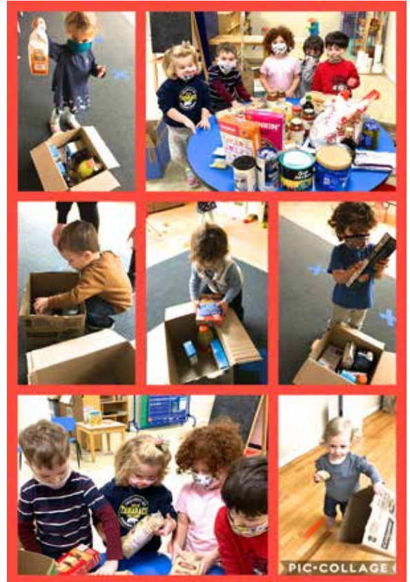
THE SHALOM YELADIMERS SORTING THE DONATIONS FOR THE INTERFAITH FOOD PANTRY.

See page 6 for Shalom Yeladim's Hanukkah Celebration!