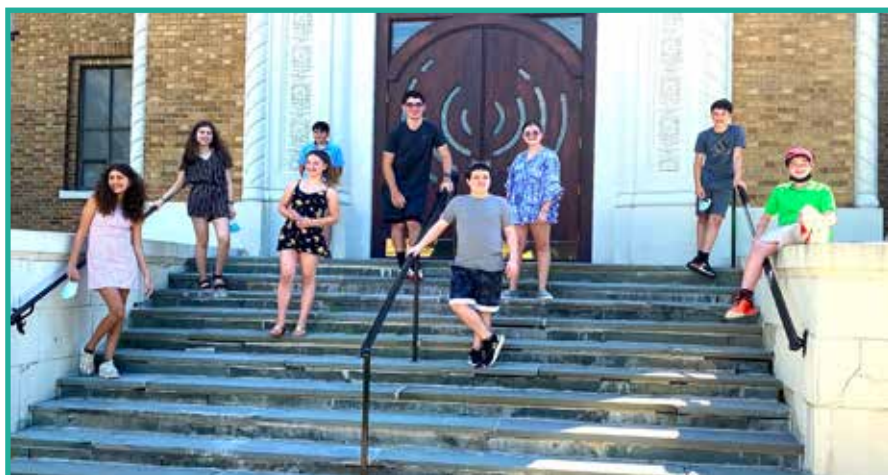
SOCIALLY DISTANCED COMMENCEMENT OF MJC BY RELIGIOUS SCHOOL'S 7TH GRADE CLASS JULY 12, 5780