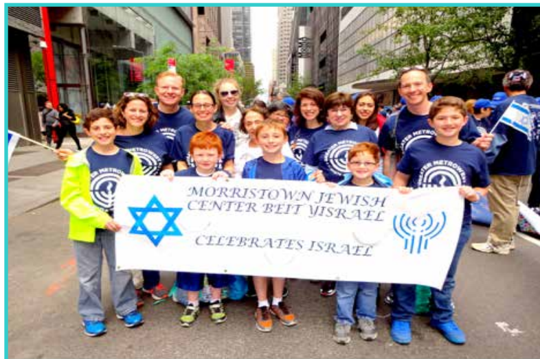
KUDOS TO EVERYONE WHO MARCHED IN THE ISRAEL DAY PARADE. THANK YOU FOR REPRESENTING MJC BY!