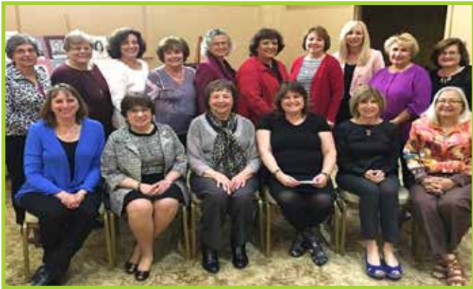
SISTERHOOD PRESIDENTS, PAST AND PRESENT, AT THE 2018 ANNUAL TORAH FUND BRUNCH