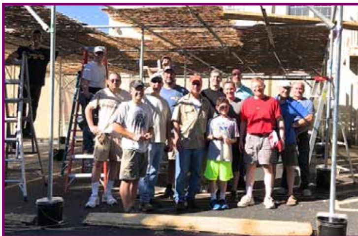
MEN'S CLUB AT WORK..... BUILDING THE MJCBy SUKKAH

If I am not for myself, who will be for me? אם איך אני לי מי לי? But when I am only for myself, what am I? וכשאני לעצמי מה אני? And if not now, when? ואם לא עכשיו אימתי? [RABBI HIRSH © PIRKEI AVOT 1:4]